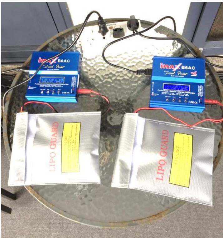
Charging my Lipos on an old glass table.