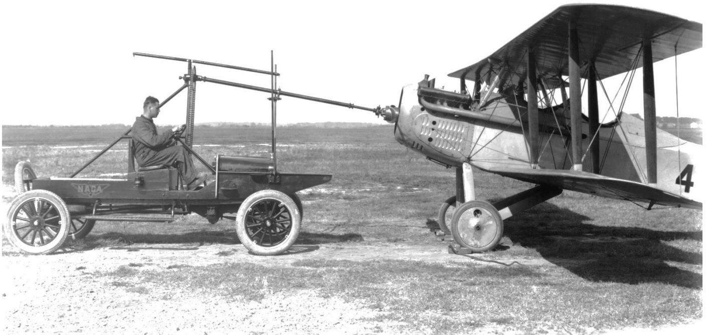
A NACA Hucks Starter with a Vought VE-7 at the Langley Research Center, 1926

A Hucks starter is an auxiliary power unit, almost always was a motor truck, that provides initial power to start up piston aircraft engines. Such Hucks starter trucks can be considered a mechanical replacement for a member of the ground crew who would have spun an aircraft's propeller by hand. This is because of the starter truck's position in front of the airplane when starting, much like a ground crew member.