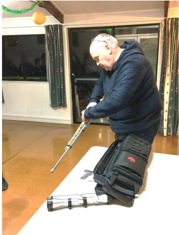
Only in the USA a firearm that comes in its own back pack